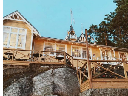
Restaurant Airi