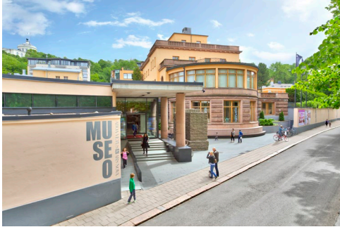
Aboa Vetus, Rettig palace

Wednesday 20th: The project dinner is held at the archipelago restaurant Airi (Valaanpyytäjänkatu 10, 20900). Transportation by boat will be organised to and from the dinner. The boat will leave at 18:30 sharp from Läntinen Rantakatu 37 and arrive to the same drop off point at approx. 22:30. It is also possible to reach the restaurant using public transport (buses 5A + 53).