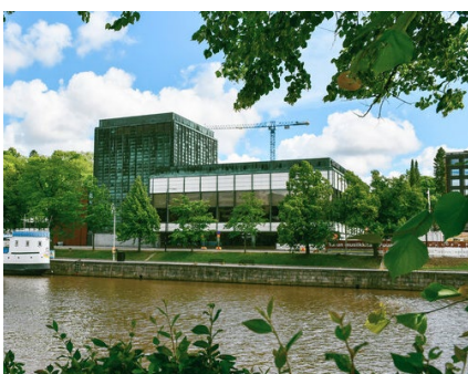
Turku City Theatre

Thursday 21st: The last day – internal Project Steering Committee meeting is held at Forum Marinum (Linnankatu 72, 20100).