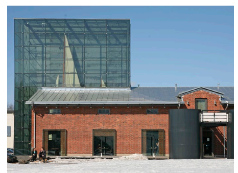
Forum Marinum